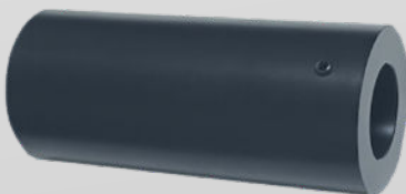
12W RGB+W LED LIGHT SOURCE