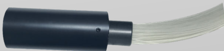
FIBRE OPTIC BUNDLE

INSERT THE COMMON END IN THE LIGHT SOURCE AND BLOCK IT THROUGH THE SCREW SET ON THE LIGHT SOURCE