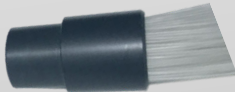
COMMON END FIBER OPTICS BUNDLE