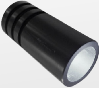
3W LED LIGHT SOURCE