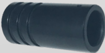
3W LED LIGHT SOURCE