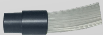
COMMON END FIBER OPTICS BUNDLE