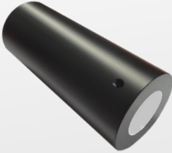
9W LED LIGHT SOURCE