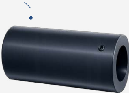
9W LED light source